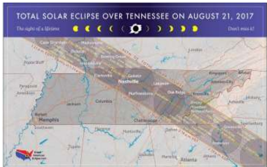
On August 21, 2017, millions of people across the United States will see one of nature's grandest sights — a total eclipse of the Sun. The Moon will completely block the Sun, daytime will become twilight, and the Sun's corona will shine in the darkness. This map shows the path of the eclipse as it passes over Tennessee.

Where will you be to experience the Total Eclipse of the Sun? The summer issue of Paris! Magazine ( www.myparis magazine.com ) has more information about the eclipse and where the best viewing places will be; or visit https://eclipse2017.nasa.gov/ for all things ‘eclips-ecal’.